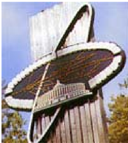
Joint Institute for Nuclear Research (JINR)