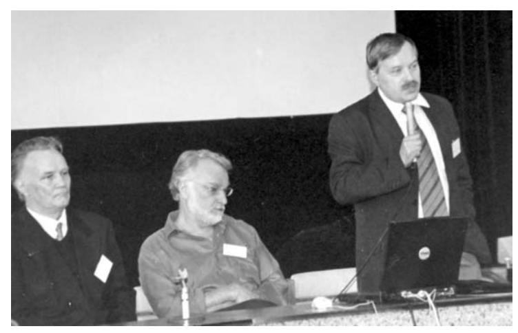
Dubna, 8–13 September. The 10th International Conference on Ion Sources (ICIS-2003)