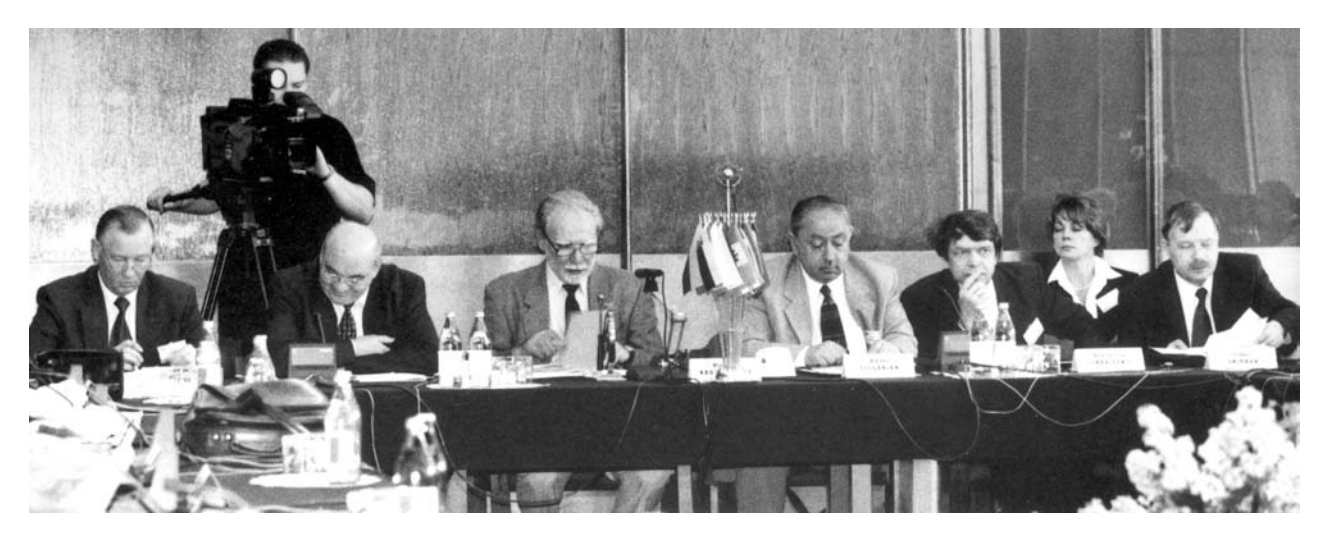
Dubna, 5-6 June. The 94th session of the JINR Scientific Council