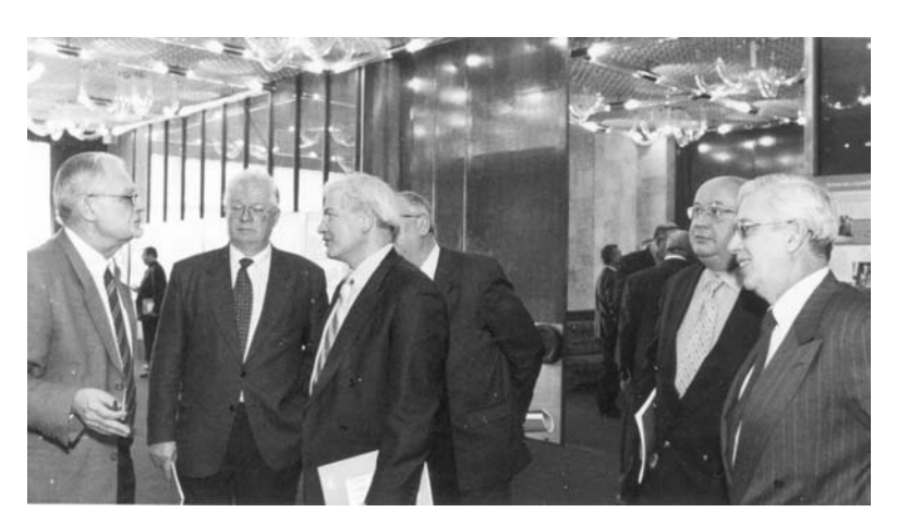
Dubna, 6 March. A delegation from the Higher Diplomatic Courses of the RF Ministry of Foreign Affairs visits JINR