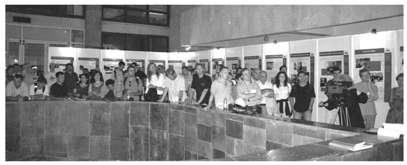
Yerevan, 27 August. XI European School on High Energy Physics. The ceremony of the opening of the joint CERN–JINR exhibition «Science Bringing Nations Together»