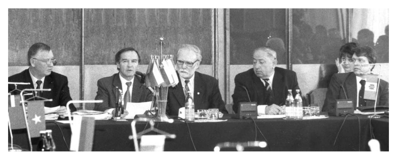
Dubna, 20-21 March. A regular session of the Committee of Plenipotentiaries of the Governments of the JINR Member States