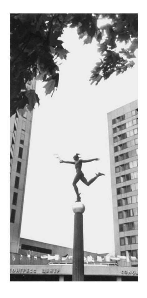
Moscow, 17–21 June. VIII international conference on nuclear physics «Nucleus–Nucleus Collisions – 2003» (NN2003)