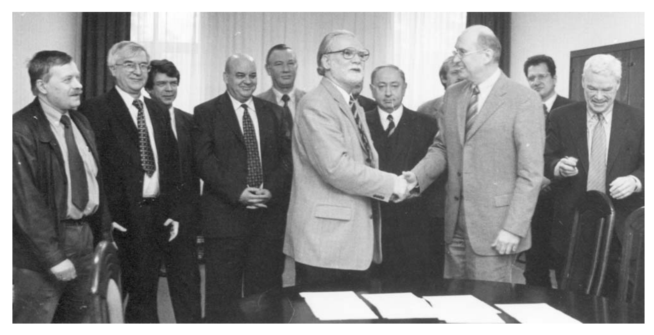
Dubna, 22 January. The signing of the BMBF (Germany) – JINR Agreement on scientific and technical cooperation for a new three-year period