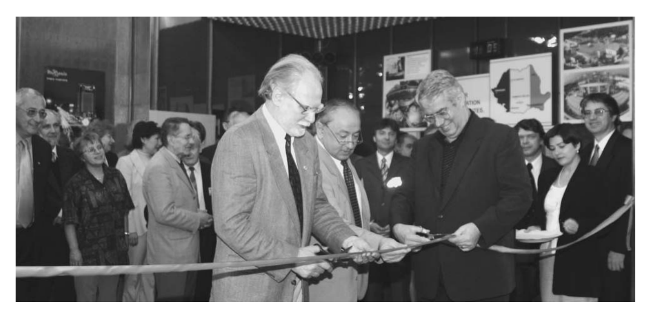
Dubna, 6 June. Round-table meeting «Romania at JINR». Opening of the exhibition