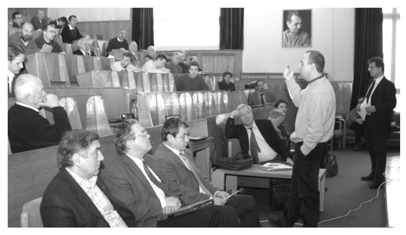
Dubna, 20 November. International JINR–GSI (Germany) Workshop on the programme of experiments at the new accelerator complex for heavy ions and antiprotons in Darmstadt