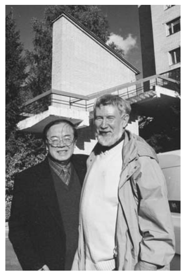
Dubna, 14 September. A visit to JINR of a delegation of the Chinese Nuclear Society