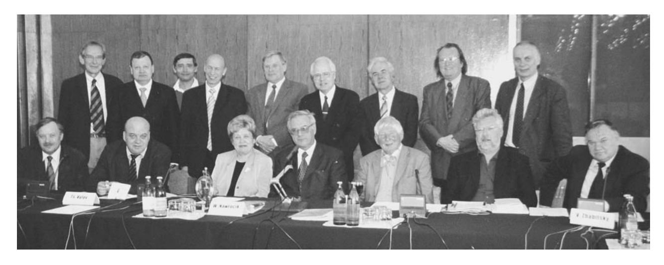
Dubna, 19–20 April. Participants of the meeting of the Programme Advisory Committee for Condensed Matter Physics