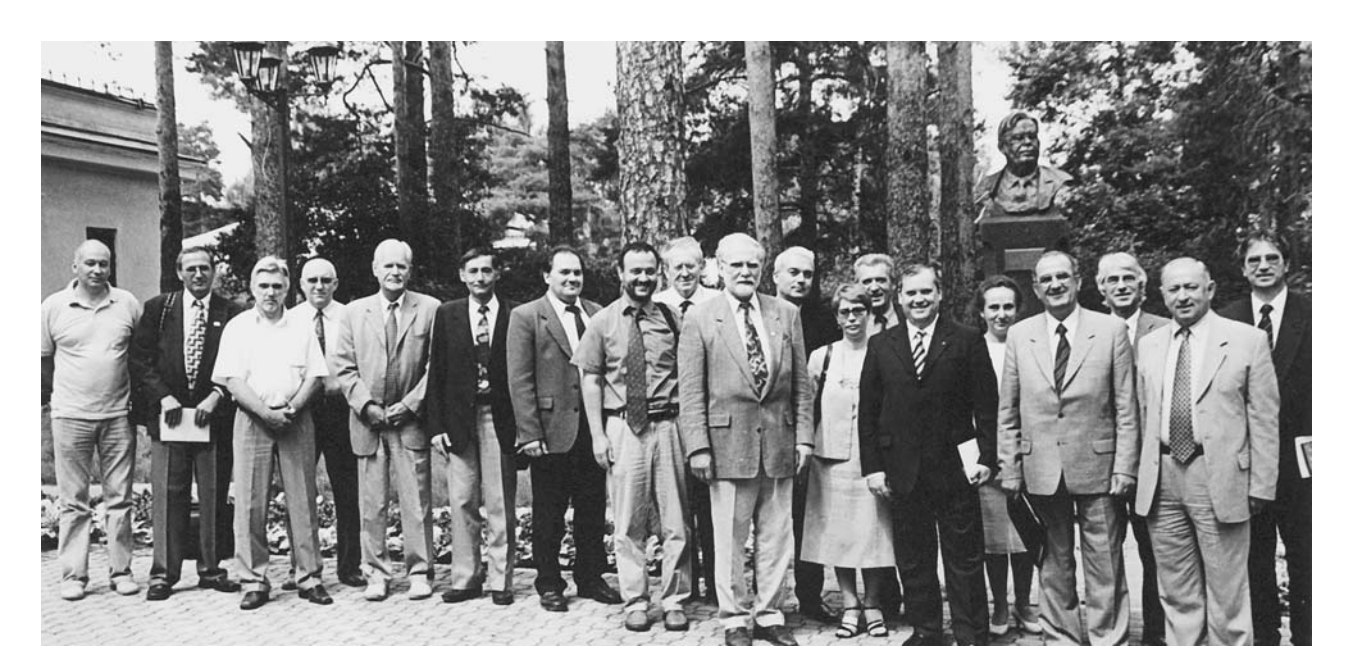
Dubna, 26 July. A visit of a Romanian delegation to JINR