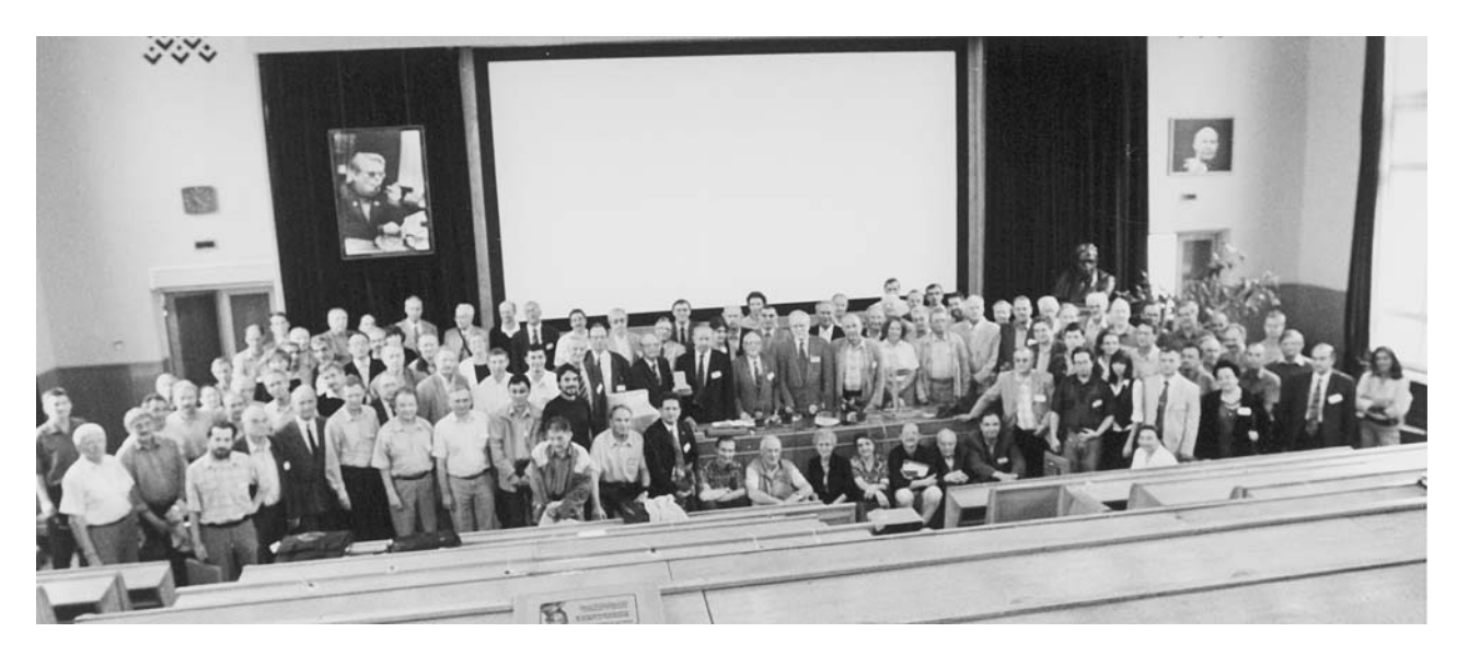
Dubna, 6 September. The Bogolyubov conference «Problems of Theoretical and Mathematical Physics»