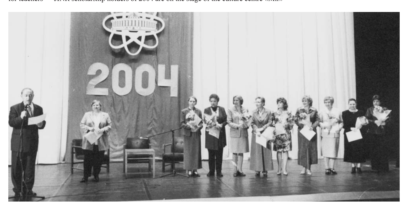
Dubna, 26 March. JINR's anniversary day. The laureates of the Dubna competition for teachers — JINR scholarship holders of 2004 are on the stage of the culture centre «Mir»