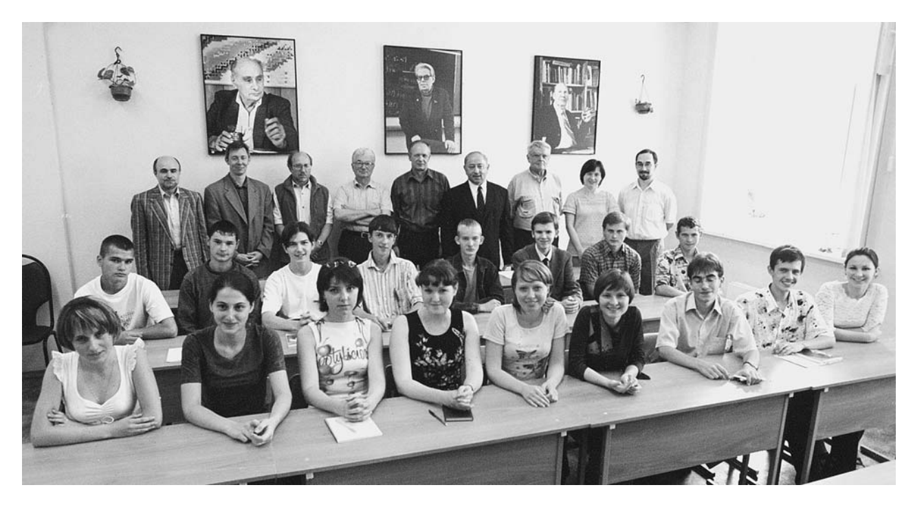
University «Dubna», 1 September. Professors and scholars of the chairs of theoretical and nuclear physics meet the first-year students