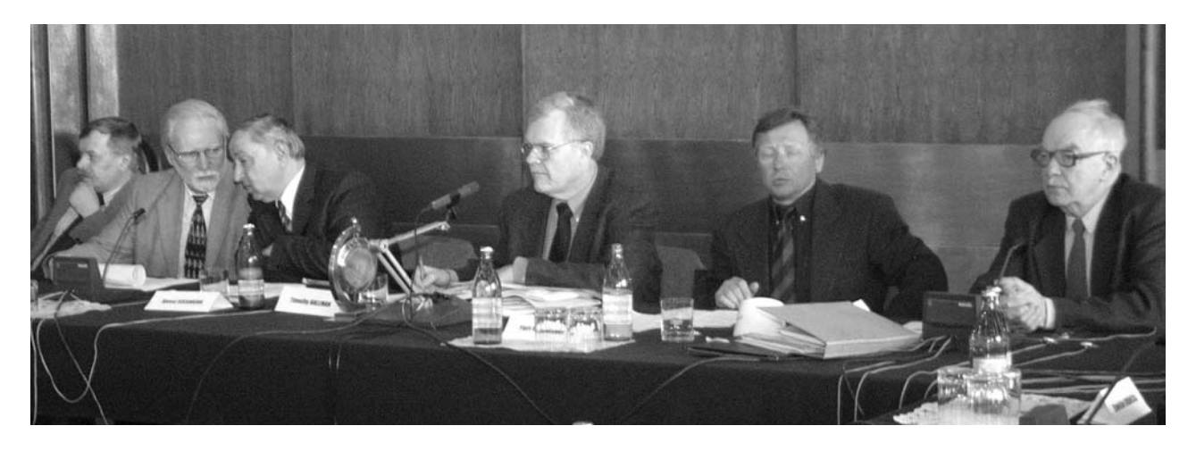
Dubna, 5–6 April. Meeting of the Programme Advisory Committee for Particle Physics