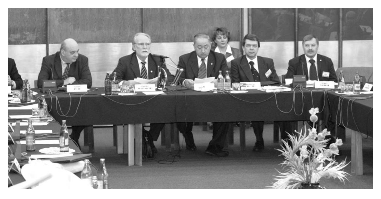
Dubna, 15 January. The 95th session of the JINR Scientific Council