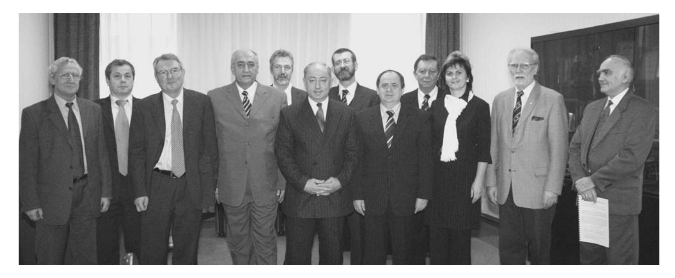
Dubna, 11 December. Participants of the ceremony of signing an agreement on the JINR-Slovakia cooperation