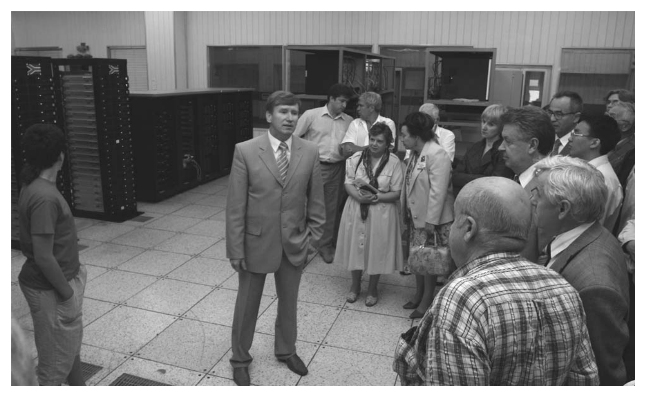
Laboratory of Information Technologies, 29 June. Presentation of three new supercomputer farms, seven times enlarging computer capabilities of the Dubna Grid network cluster