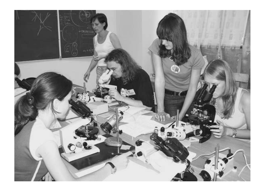
Dubna, 24 June – 22 July. Participants of the 4th International Summer Student Practice in JINR Fields of Research