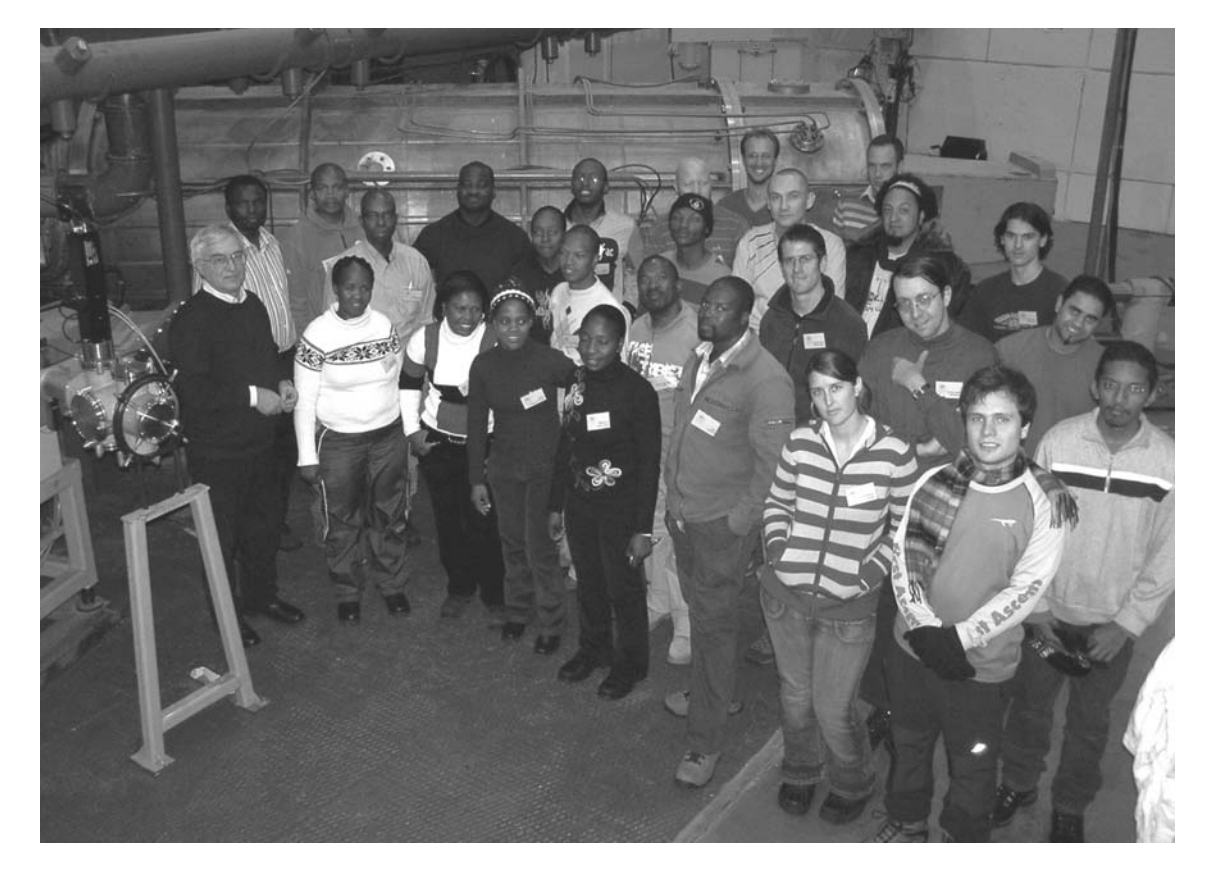
Dubna, 9-18 December. South African students and postgraduates on their practice studies at JINR