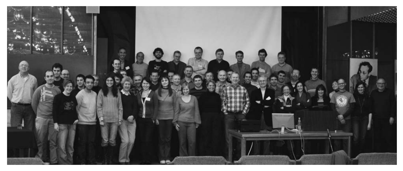
Dubna, 10-13 December. Participants of the workshop of the international NEMO-3/SuperNEMO collaboration

Dzhelepov Laboratory of Nuclear Problems. The cryostat produced by JINR staff members for a new polarized target of Mainz University (Germany)