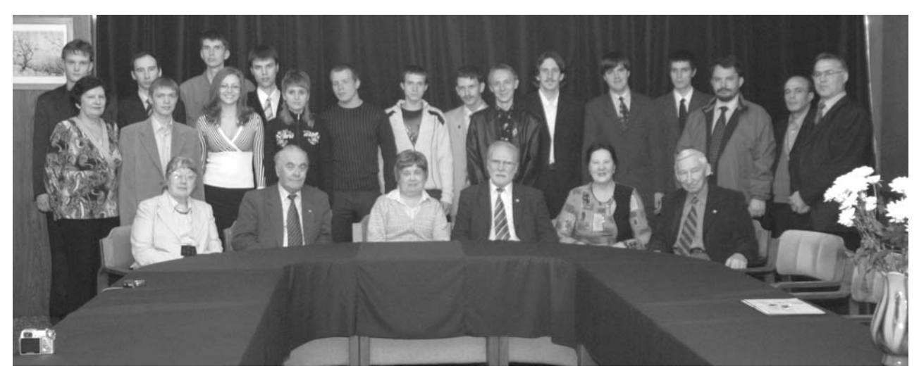
Dubna, 30 March. Graduates of MIREA's chair of electronics and automatics for physics facilities with the representatives of JINR and the Raduga State Design Bureau after the Diploma awarding ceremony

Dubna, December. Teachers and diploma students from SRINP of MSU after theses defence