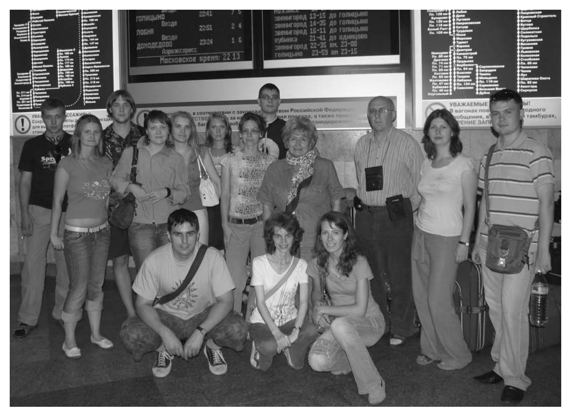
JINR participants of the 4th international school «Nuclear Methods and Accelerators in Biology and Medicine», held on 8–19 July in Prague (Czech Republic)