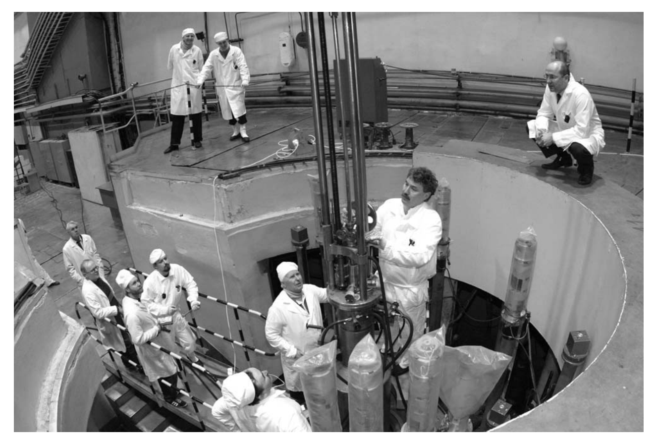
Frank Laboratory of Neutron Physics, March. Unloading the IBR-2 reactor active zone