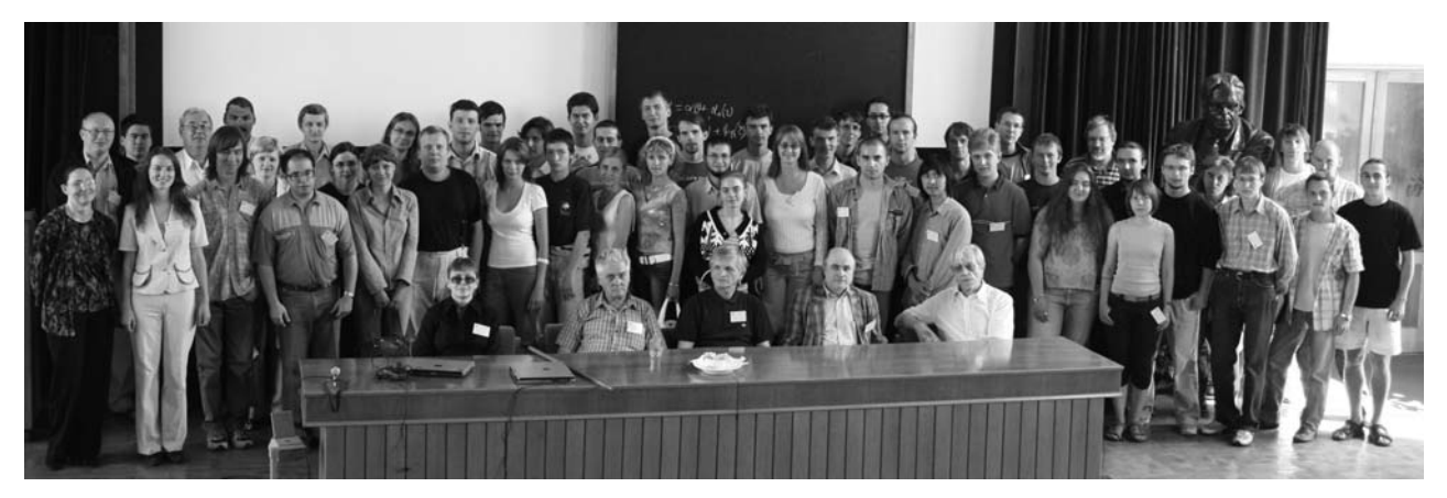
Dubna, 22-30 July. Students and teachers of the 5th International School on Modern Mathematical Physics