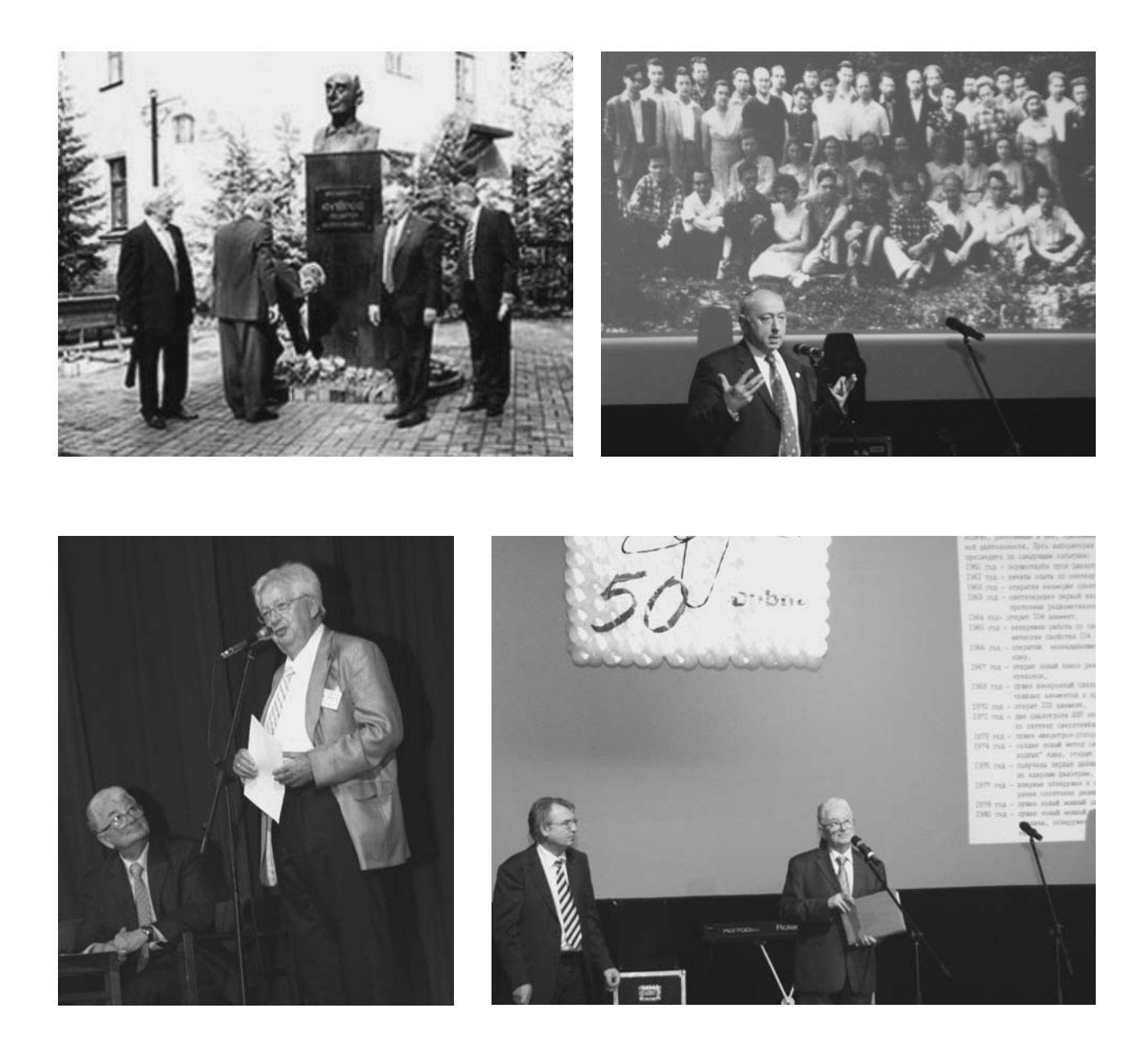
Dubna, 24-26 May. Festive events to mark the 50th anniversary of the establishment of the Laboratory of Nuclear Reactions