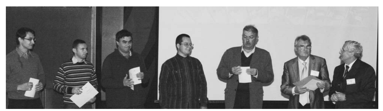
Dubna, 25–26 September. The 104th session of the JINR Scientific Council