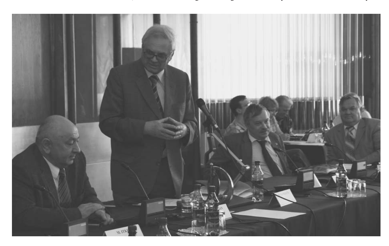
Dubna, 16–17 June. Meeting of the Programme Advisory Committee for Condensed Matter Physics Dubna, 19–20 June. Meeting of the Programme Advisory Committee for Nuclear Physics