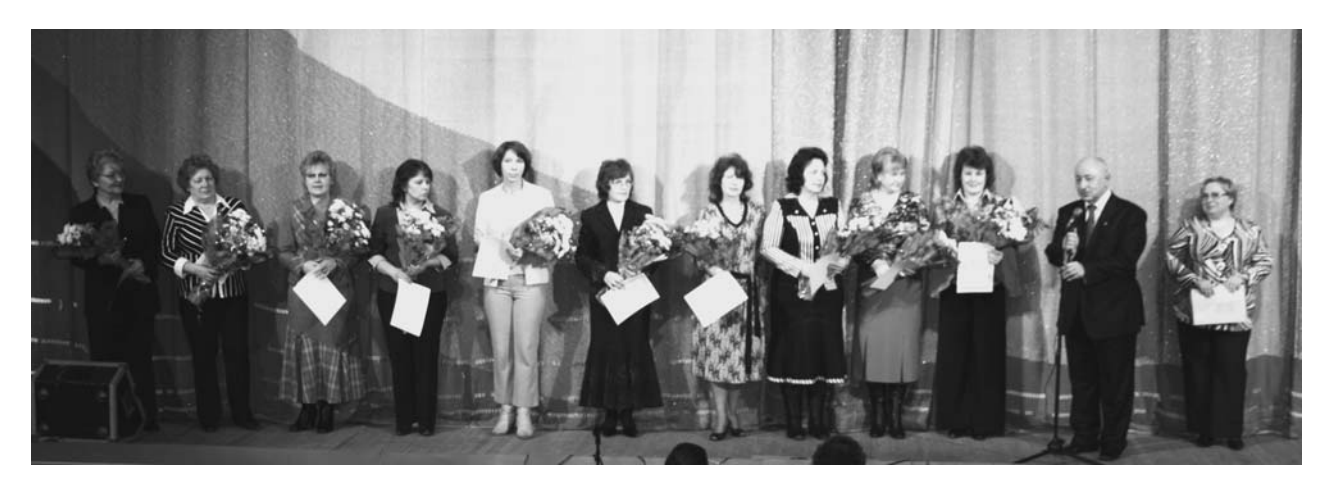
Dubna, 15 March. JINR scholarships are presented to the best teachers of the city for their excellent skills in pedagogics