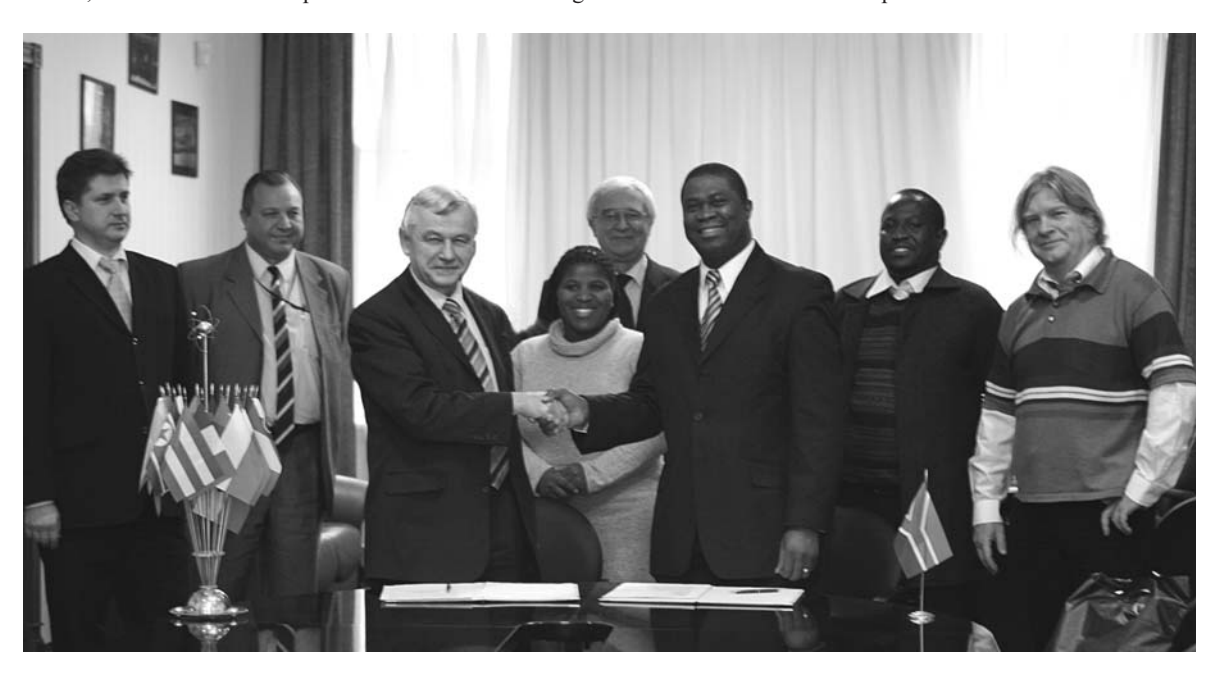
Dubna, 14 November. Participants of the 6th Coordinating Committee on JINR-RSA cooperation