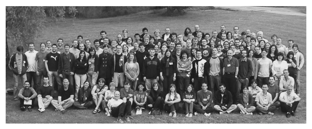
Herbeumont-sur-Semois (Belgium), 8–21 June. Participants of the European School on High Energy Physics