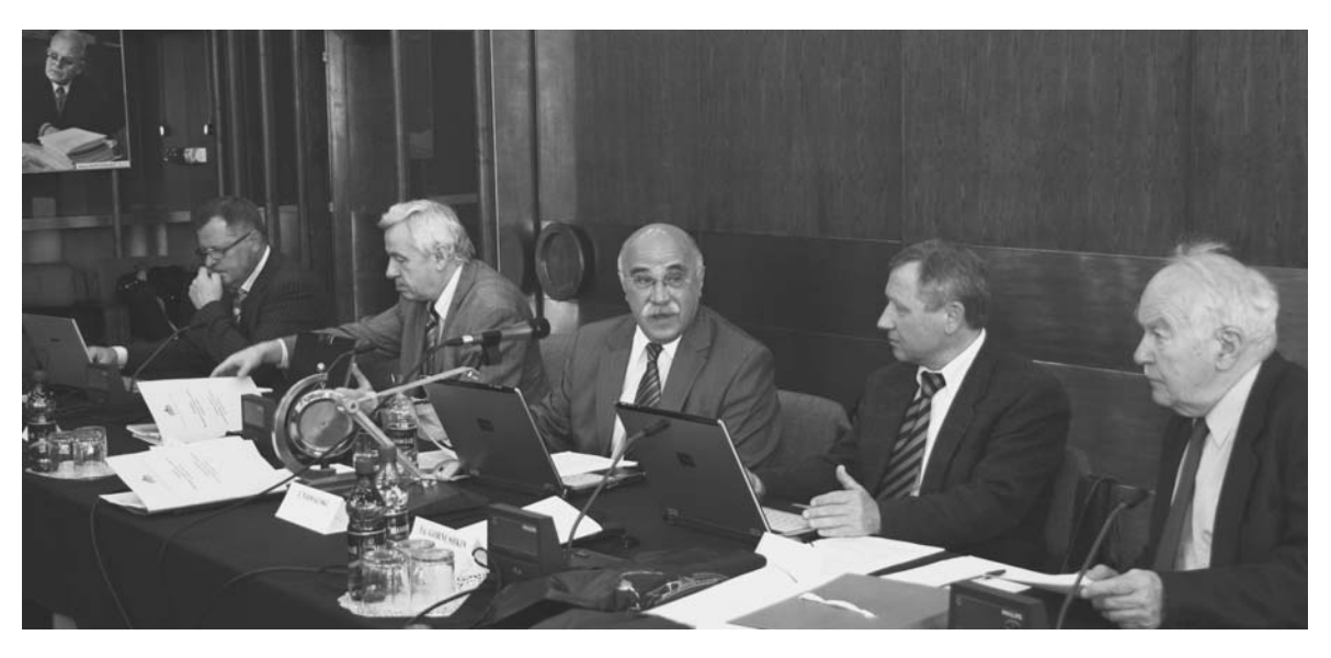
Dubna, 10–11 June. Meeting of the Programme Advisory Committee for Particle Physics