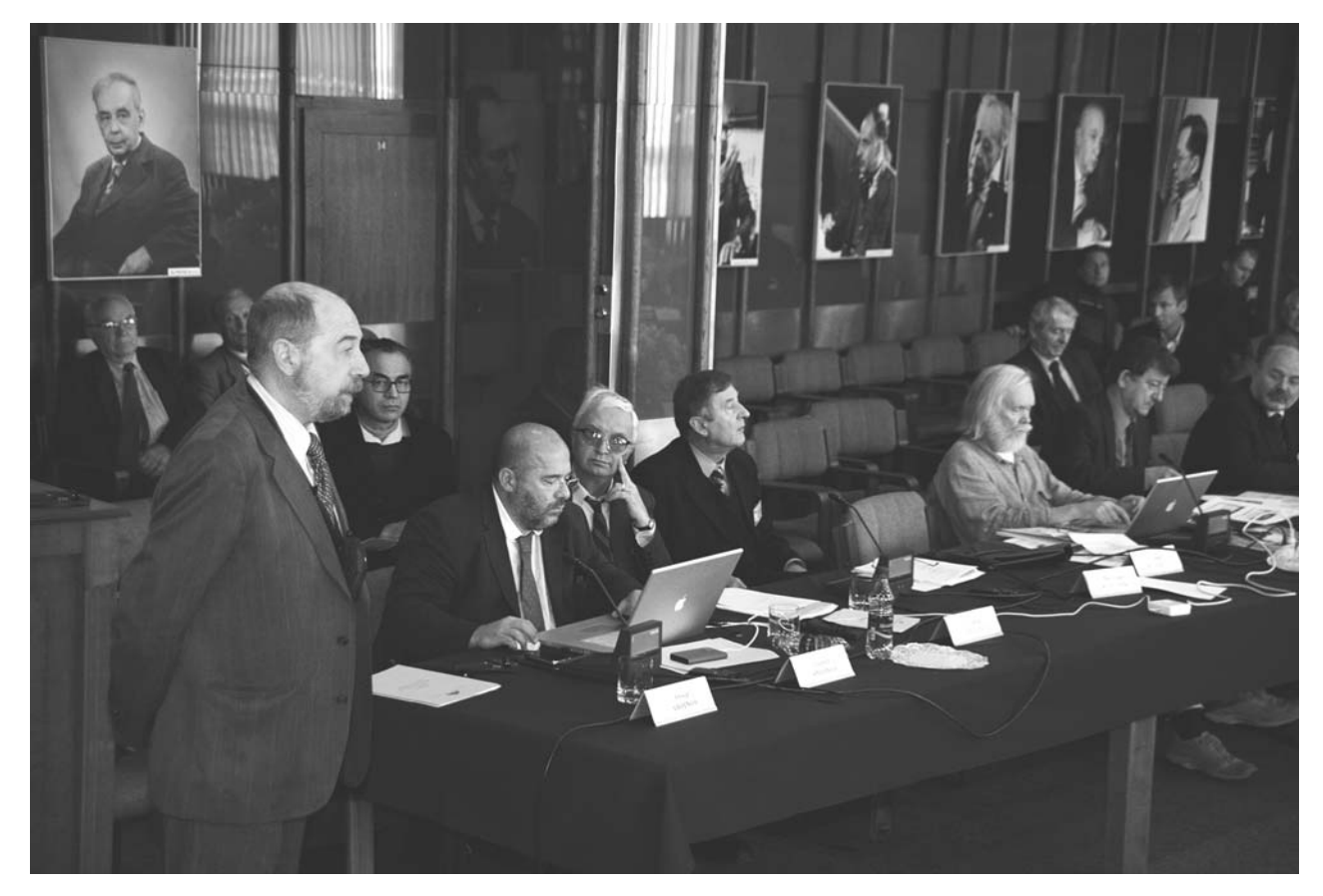
Dubna, 21–22 February. The 103rd session of the JINR Scientific Council