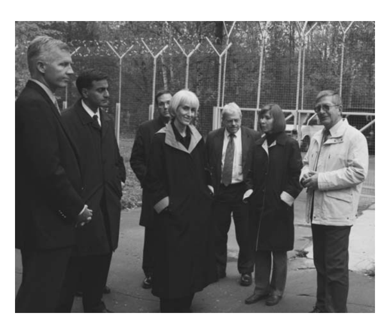
Dubna, 24 September. A delegation of the US Congress Commission on the Prevention of Weapons of Mass Destruction Proliferation and Terrorism headed by Ambassador Wendy R. Sherman (in the centre) on a visit to JINR