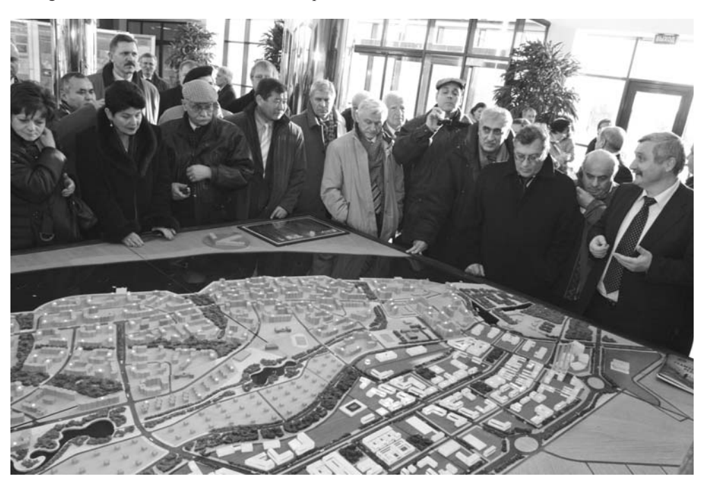
Dubna, 21–22 November. A regular session of the Committee of Plenipotentiaries of the Governments of JINR Member States