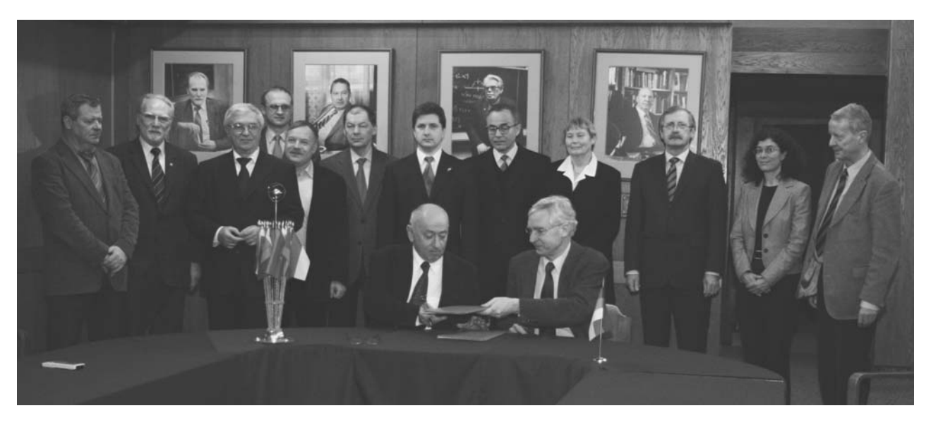
Dubna, 28–29 February. Participants of the 18th meeting of the Steering Committee on the implementation of the Agreement between the Federal Ministry of Education and Research of Germany (BMBF) and the Joint Institute for Nuclear Research