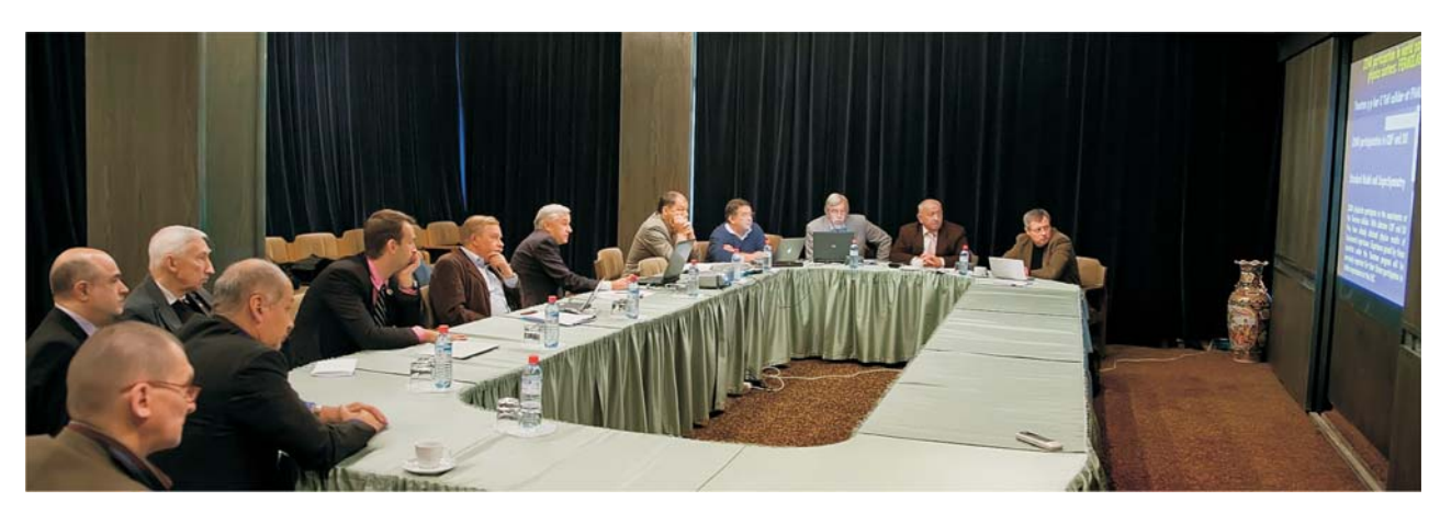
Dubna, 11 October. Meeting of the JINR-CERN Cooperation Committee