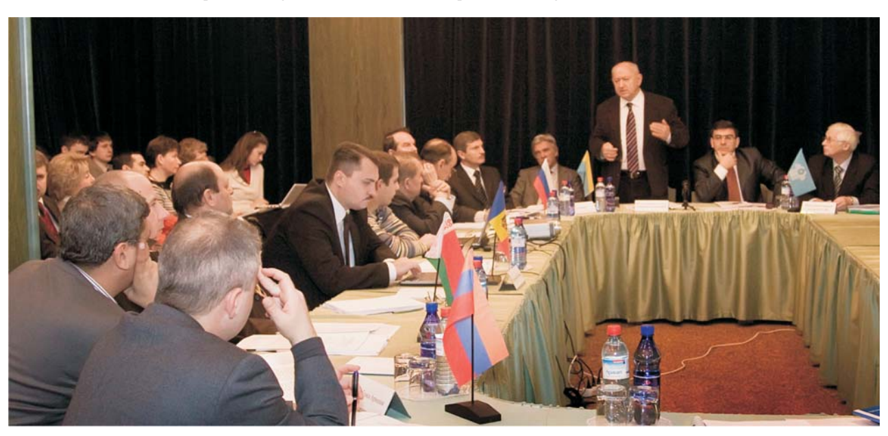
Dubna, 24 November. The second meeting of the Working Group on the elaboration of a draft of the Interstate Purposeful Programme of Innovation Cooperation among CIS countries