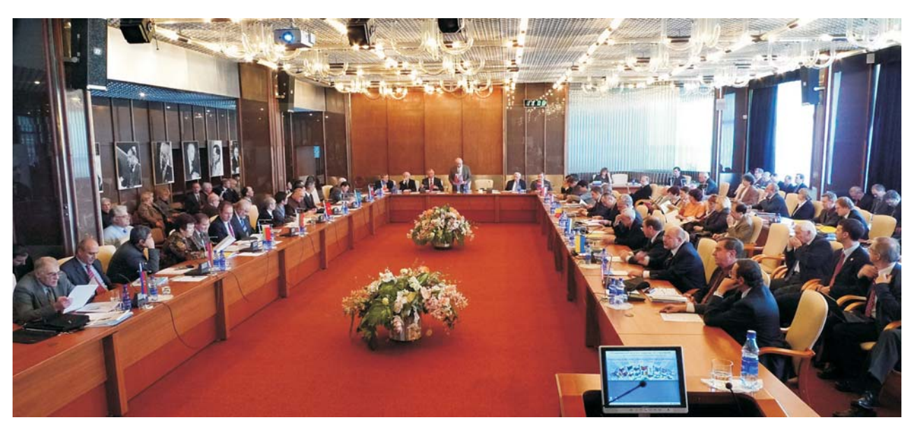
Dubna, 27–28 March. Session of the JINR Committee of Plenipotentiaries