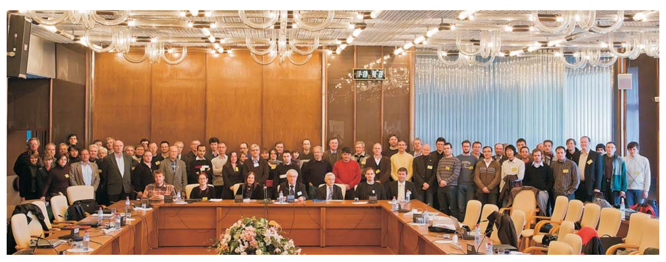
Dubna, 7 October. Participants of the meeting on new projects of the NuSTAR collaboration in the framework of the FAIR programme (GSI, Germany)