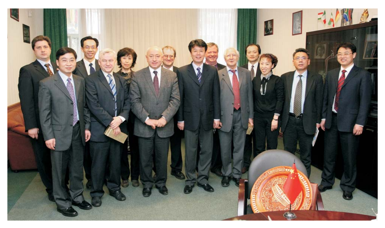
Dubna, 30 March. A delegation of the State Administration of the People's Republic of China on foreign experts affairs at the JINR Directorate