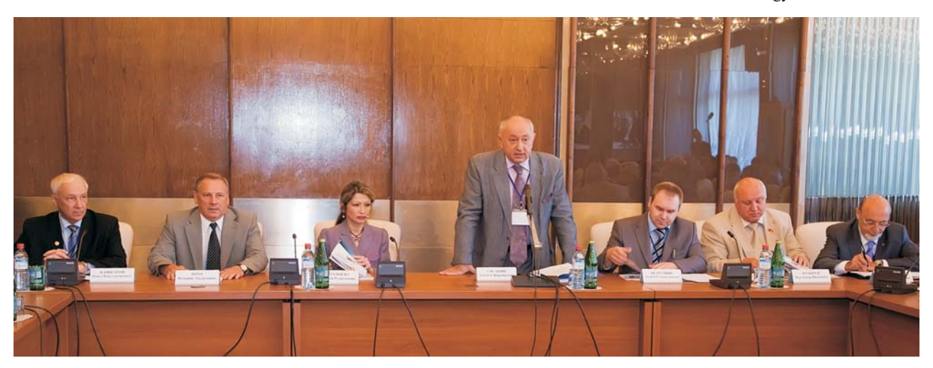
Dubna, 1 July. The opening ceremony of the organizational-informational forum «Establishment of the International Innovation Centre for Nanotechnology of CIS Countries»