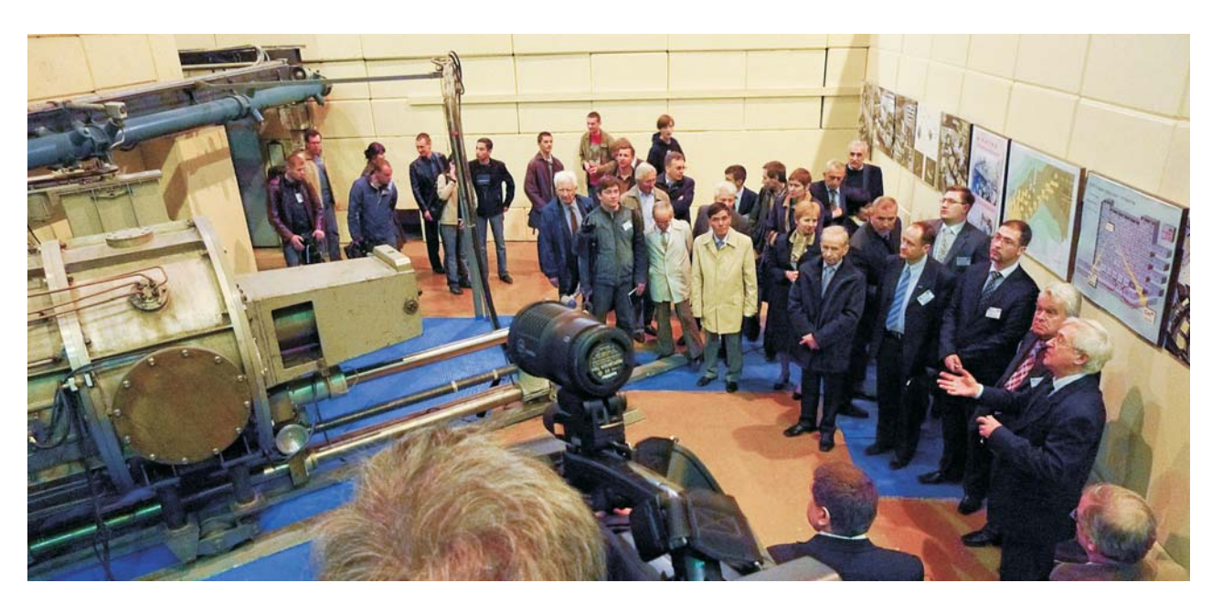
Dubna, 14-15 May. Days of Moldavian Science at JINR