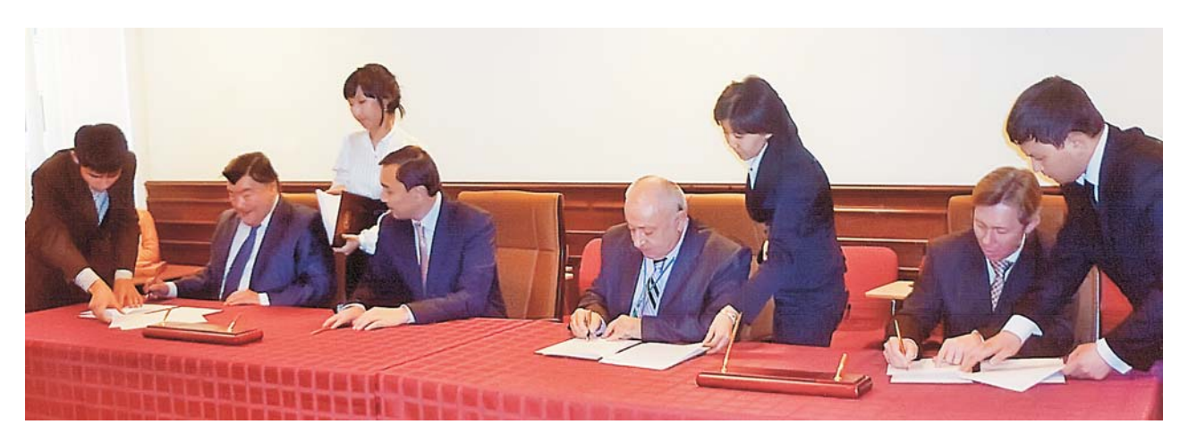
Astana (Kazakhstan), 19 November. Signing of the Agreement on joint training of Bachelors and Masters in nuclear physics between JINR and the Gumilev Eurasian National University