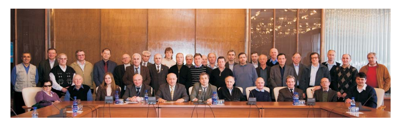
Dubna, 7–8 April. Participants of the meeting of the RAS Scientific Council on electromagnetic interactions «Electromagnetic Interactions of Relativistic Nuclei and Hadrons»