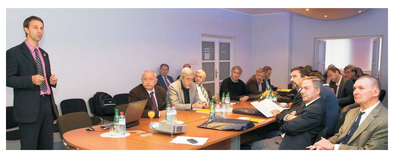
Dubna, 10 October. Meeting of the European Committee for Future Accelerators (R-ECFA)