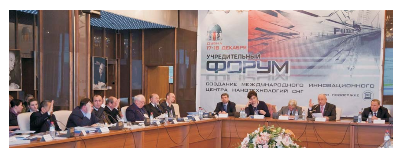
Dubna, 17–18 December. The constitutive forum «International Innovation Centre for Nanotechnology of CIS Countries (IICNT CIS): Status and Prospects»

Dubna, 18–19 December. Presidium of the Italy–Russia round-table discussion «Efforts in Fundamental Research and Perspectives for Applied S&T and Business Development»