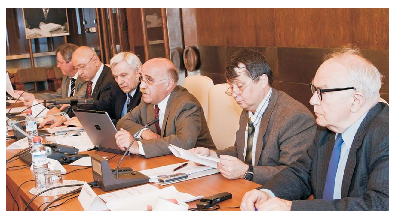
Dubna, 10-11 June. Meeting of the Programme Advisory Committee for Particle Physics