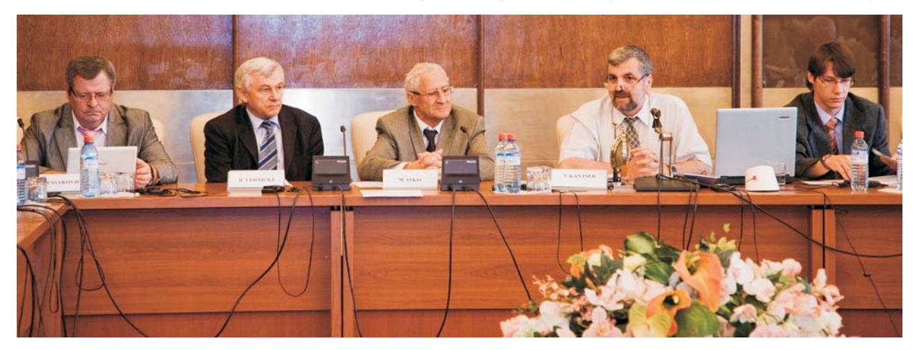
Dubna, 25–26 June. Meeting of the Programme Advisory Committee for Condensed Matter Physics