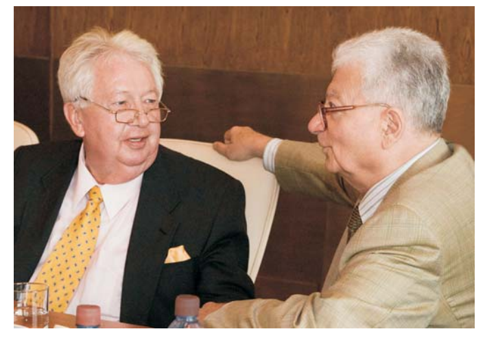
Dubna, 22-23 June. Participants of the meeting of the Programme Advisory Committee for Nuclear Physics