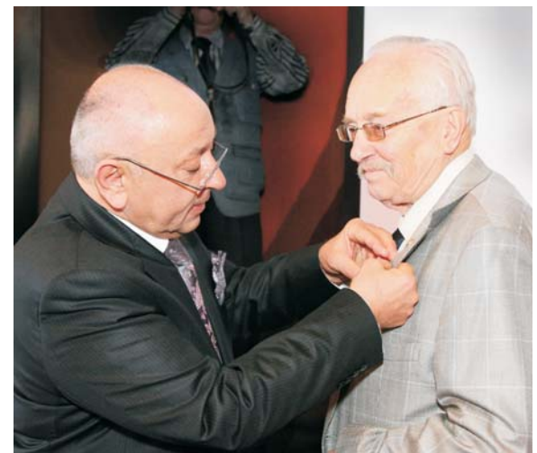
Dubna, 19-20 February. The 105th session of the JINR Scientific Council