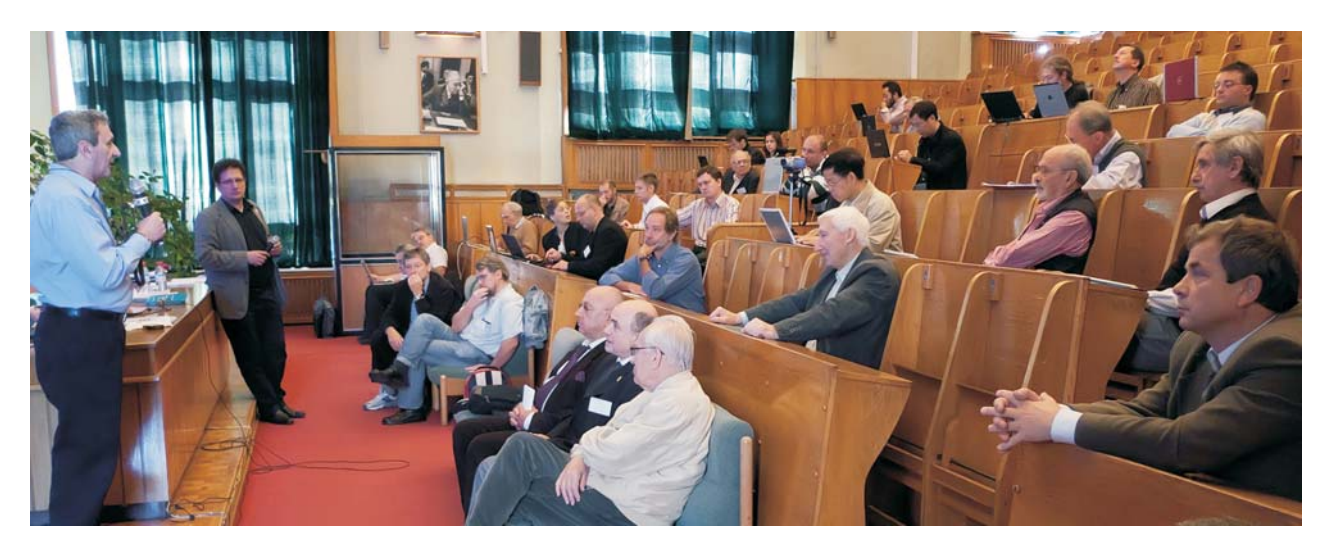
Bogoliubov Laboratory of Theoretical Physics, 9 September. The 4th round-table discussion «Physics at the NICA Collider»